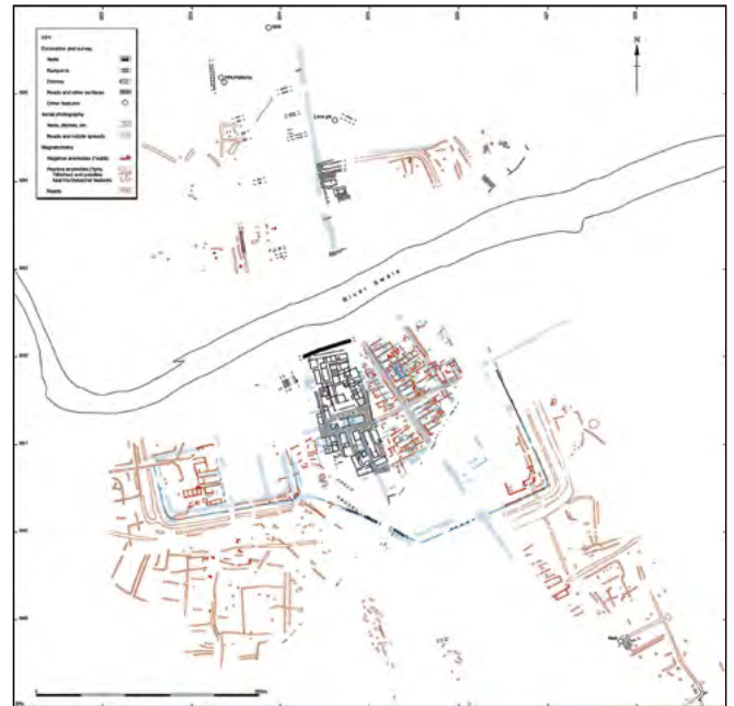
Figure 7 Catterick Roman town, North Yorkshire. Plan showing all the evidence from remote sensing and excavations.

The application of modern techniques, particularly extensive geophysical survey, as at the towns of Wroxeter (Shropshire), Richborough (Kent) and Catterick (North Yorkshire; Figure 7) and on particularly the northern vici , such as Maryport, Cumbria and other sites such as Sedgefield, County Durham has transformed our understanding of both settlements and in some cases their hinterlands. At Wroxeter the 'old certainties' of the sparsely built-up town have been challenged and overturned and at Maryport and Sedgefield the sheer scale of the civilian settlement revealed. Similar advances in understanding can also be seen across other settlement types.