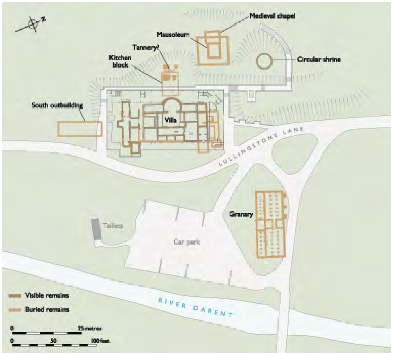
Figure 6 Lullingstone Roman villa, Kent. Overall site plan showing all known buildings and the relative lack of agricultural buildings expected of a 'typical' villa.

The nature of construction varies widely, reflecting function, status, and the availability of local building materials. Stone-founded buildings are fairly commonplace, and sometimes a timber superstructure, either timber-framed or post-built, may be assumed. Both urban and rural buildings (for instance, Frocester villa, in Gloucestershire, where this was suggested by massive foundations) could be of more than one storey. Typically locally-quarried stone and locally-manufactured tiles and other materials were employed in buildings; however, the higher the status of structures, or the degree of official involvement