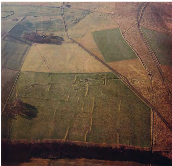
Figure 3 Settlement, fields and trackway, Knook Down East, Wiltshire. A Romano-British village.

sites often incorporate a large open space that is 'village green' like in character. Evidence for complex water management in the form of leats, ponds and reservoirs has been noted.