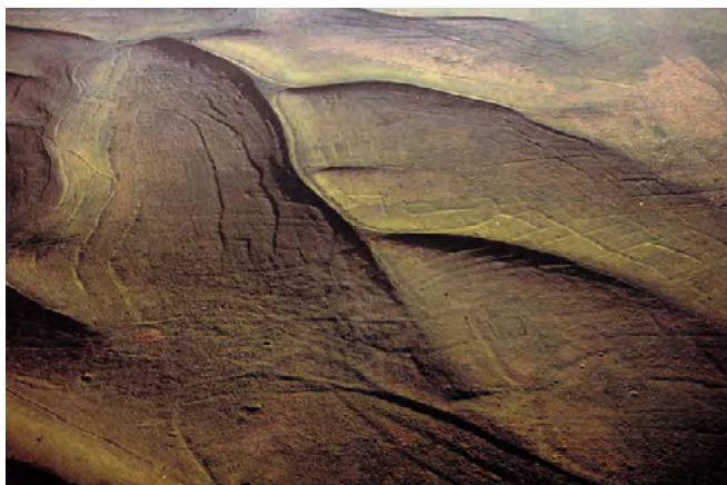
Figure 4 Settlement, fields and trackway, Charlton Down, Wiltshire. A Romano-British village.

Isolated Farmsteads are typified by rectilinear or curvilinear enclosures rarely more than 1 ha in area within which there is evidence for a range of domestic buildings and associated structures. They are normally defined by internal banks and external ditches, usually furnished with one main entrance; however, open farmsteads such as Park Brow, West Sussex, are also known.