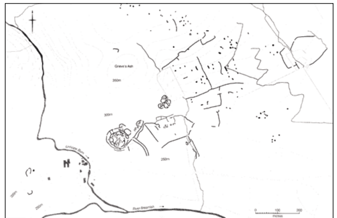
Figure 2 Grieve's Ash settlement and fields, Northumberland. Late Iron Age and Romano-British settlements and fields.

and fields. Here the domestic and subsidiary structures can be of traditional ‘roundhouse type’, or rectilinear structures implying ‘Roman influence’, or combinations of the two.