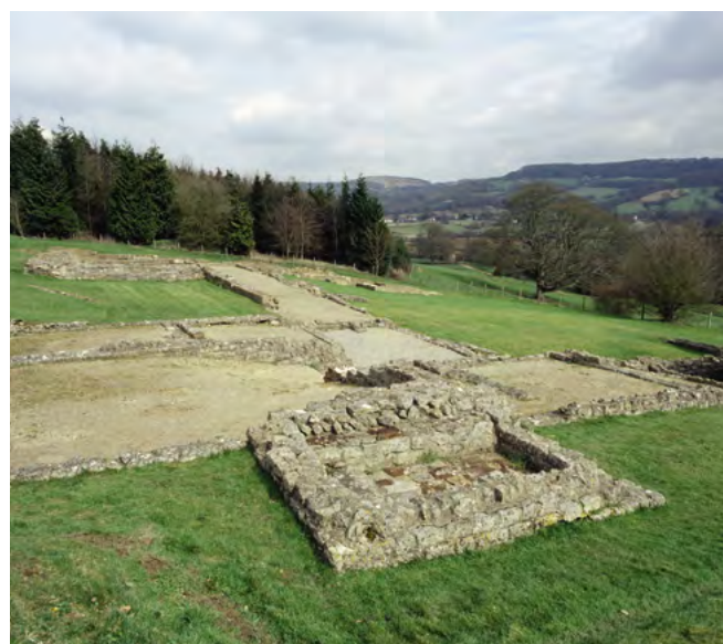
Figure 5 Great Witcombe Roman villa, Gloucestershire. Visible remains of the North-West Range looking east.

Major and minor villas are distinguished from other rural settlements by the degree of adoption of 'Roman' traits, with rectilinear buildings forming the bulk of the structures, although ovoid and circular structures are known at sites such as Beadlam, North Yorkshire. Basic plan forms for the main structures include cottage house, winged corridor, courtyard and aisled houses. The largest sites can incorporate multiple courtyards, often distinguished as 'domestic' and 'agricultural', although apparently domestic structures – often aisled halls, possibly for estate workers and/or a 'bailiff' – can appear in the lesser courtyard. Embellishments of the main house can include mosaics and wall painting, internal bath suites and multiple ranges of rooms (Figure 5). The large sites may be expressions of the wealth of a particular family, but it seems clear on some sites that the domestic complex and buildings were occupied by multiple families, perhaps indicative of sub-division by inheritance. Other structures can include secondary bath suites (for estate workers), shrines or nymphaea , and in the case of Lullingstone (Kent) (Figure 6) at least, a house-church. With the exception of Fishbourne, few of the very substantial 'palatial' sites have been extensively explored; nevertheless, at all of these the investment in sumptuous facilities and lavish decoration is clear.