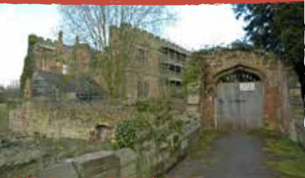
Astley Castle before and after repair

Astley Castle, a fortified manor house, was ruinous and gutted by fire when it was put on our original Buildings at Risk Register. In 2005, the Landmark Trust took a 99 year lease on the castle, developing an innovative project for reuse as holiday accommodation. £2.5 million was raised from the Heritage Lottery Fund, Historic England and a wide range of trusts and donors. With specialist advice from Historic England and North Warwickshire District Council, the fabric beyond repair was recorded and salvageable medieval stonework tied together with new glass walls. Visitors love the clear sense of the building's history. The project won the Stirling Prize for Architecture in 2013. As well as being a popular holiday home, locals enjoy tours and events throughout the year.