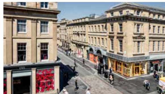
Substantial investment in the regeneration of Grainger Town, Newcastle-upon-Tyne, over the last two decades has resulted in a thriving and vibrant city centre

However, lack of funding and expertise can prevent owners from repairing their buildings. We've given around £50 million in grants to help repair buildings at risk since 1998 and provided bespoke advice and guidance for many more. Our tailored advice plays an important role in brokering solutions, helping the often complex task of turning visions into reality. Looking to the future, we will continue to champion heritage at risk, ensuring that irreplaceable heritage can make its fullest possible contribution to society now and for many years to come.