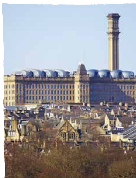
Lister Mills, Manningham, Bradford

@HistoricEngland Historic England historicengland