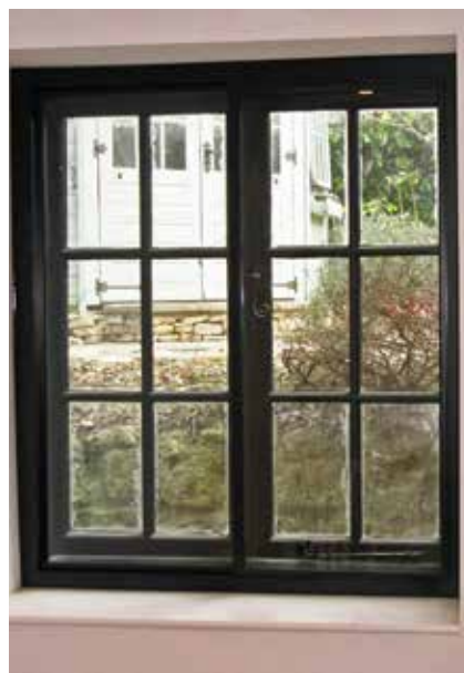
Figure 16 (centre) A secondary glazing unit colour matched to the primary window for minimal impact.