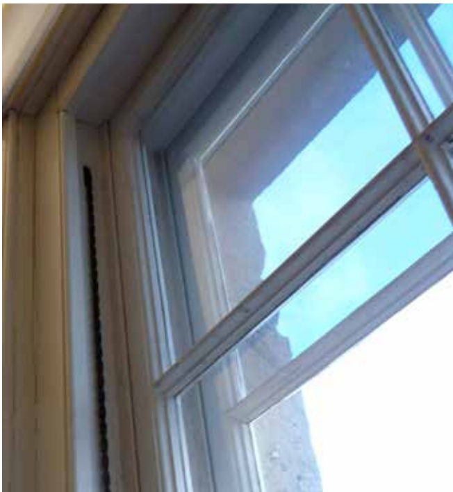
Figure 1 A 19th century secondary glazing arrangement comprising two sets of double hung sashes.

Secondary glazing is a fully independent window system installed to the room side of existing windows. The original windows remain in position in their original unaltered form. Secondary glazing is available as openable, removable or fixed units. The openable panels can be either side hung casements or horizontal or vertical sliding sashes. These allow access to the external window for cleaning and the opening of both the secondary glazing and external windows for ventilation. Fixed forms of secondary glazing are designed to be removed in warmer months when the thermal benefits are not required.