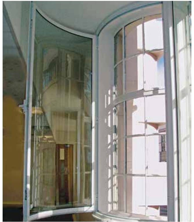
Figure 8 (top left) Side hung casement secondary units fitted to double hung sash window.