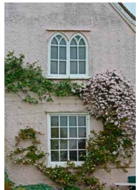
Figure 17 (right) Secondary glazing added to these windows makes no visual impact externally.

Secondary glazing can be visually intrusive externally and internally if badly designed. To minimise the visual effect of secondary windows externally, try to make sure the secondary glazing is not smaller than the glazed area of the existing window. Try to place any divisions in the glazing behind the window meeting rails or glazing bars. The flat reflections of modern glass within secondary glazing can be minimised by using anti-reflective glass.