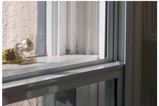
Figure 4 (top)

Draught-proofing should be the first option to consider for improving the energy efficiency of windows in an older building.