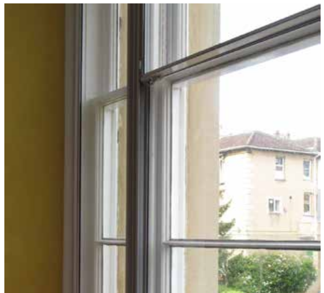
Figure 6 (top) Horizontal sliding secondary sashes used with a leaded light window.