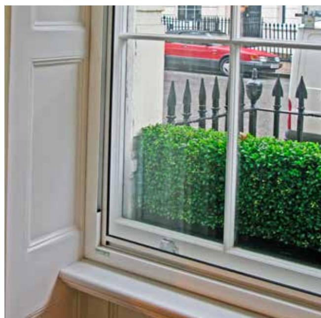
Figure 13 Secondary glazing carefully incorporated with window reveal panelling.