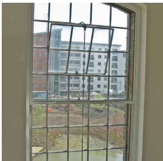
Figure 12 Vertical sliding secondary sashes used with a cast iron window.

In the design process the following is an indication of the type of factors to be considered with key issues being the minimisation of damage and ease of use. The purpose of the installation will guide the fixing position and type of glass specified.