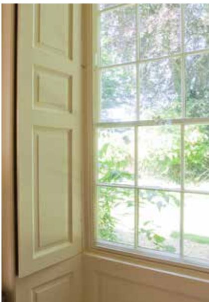
Figure 15 (left) Slim profile secondary glazing used in conjunction with opening shutters.

Where shutters or other joinery are present, careful thought will be required. Sometimes secondary glazing can be positioned between the primary window and the shutters so that the shutters still function. If the shutters are housed within the window reveal it may be possible to install secondary glazing on the room side of the shutters. If the secondary glazing cannot be inserted without making the shutters inoperable the shutters could be fixed shut but not altered so that they can be brought back into use at a later date.