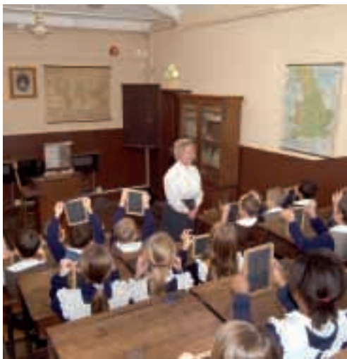
School children receive a Victorian lesson, the British Schools' Museum, Hitchin