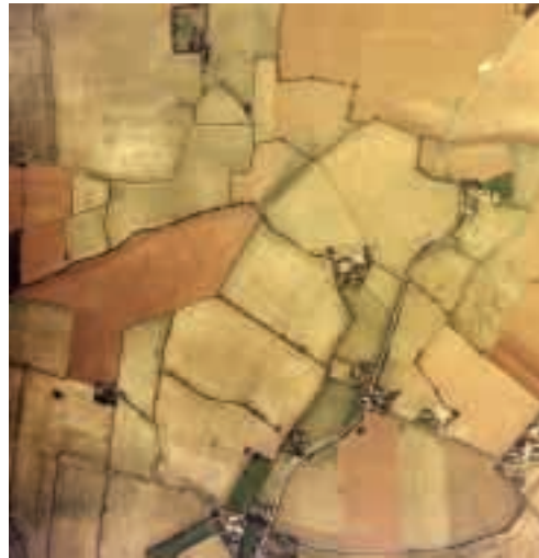
Historic field systems, Hitcham, Suffolk

The East of England has the highest number of archaeological finds recorded on HERs (156,114 or 50 per cent of the national total of 311,071) and most of these finds, 113,806 are from the Norfolk sites and monuments record. This reflects Norfolk County Council's efforts to liaise with metal detectors over the last 25 years, the success of the Portable Antiquities Scheme in Norfolk, the rich archaeological resource and the high proportion of land which is regularly ploughed. Norfolk also had the highest number of treasure cases of any English county, 188 between 1997 and 2001.