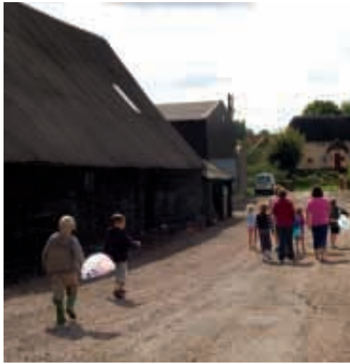
Play scheme at Bury Farm, Nuthampstead