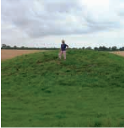
Norfolk Monuments Management, Project Officer at burial mound, Harpley Common