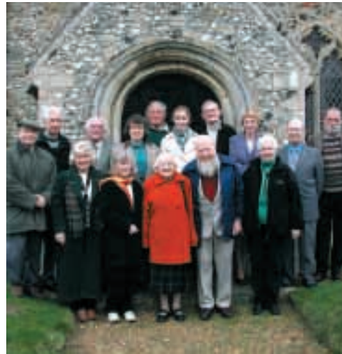
Volunteers from the Wayland Church Tours Project

Volunteers are involved in a wide range of activities including conservation work, serving on governing bodies, promotion and education, fundraising, monitoring planning applications and welcoming and guiding visitors to sites. VisitBritain's annual Visits to Visitor Attractions Survey found that there were 2,423 volunteers employed at the sites in the East of England. The National Trust have just under 4,000 active volunteers in the East of England, and other large organisations working in the region such as English Heritage and the Historic Houses Association also benefit from the work of volunteers. More research is needed to quantify the scale and impact of voluntary work in the region.