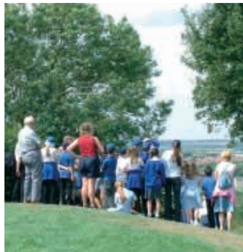
Rayleigh Mount, Essex