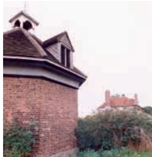
Dovecote at High House Farm, Purfleet, Essex

This region's buildings at risk register has the highest percentage of any English region of religious, ritual and funerary buildings (38 building items or 29 per cent of the region's register) and of agricultural and subsistence buildings (18 items, 13.7 per cent of the regional register). Defence structures (14, 10.4 per cent of the regional register) and domestic buildings (30, 22.2 per cent of the regional register) are other significant categories, regionally and nationally.