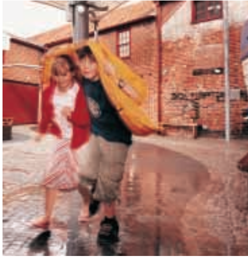
Time and Tide Museum, Great Yarmouth