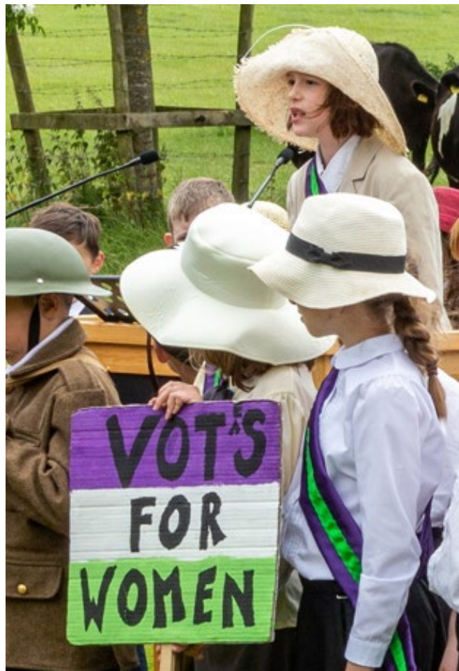
Marking 100 years since some women were given the vote at Killerton House, Devon.

To find out more go to http://dreadnoughtsouthwest.org.uk/rebellious-sounds-archive/