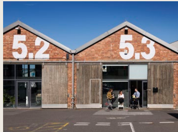
Bristol's Paintworks is a great example of a successful creative enterprise based in a historic building.

The Paintworks, Bristol. Originally dating back to 1850, Phoenix Wharf was formerly a paint and varnish factory for approximately 100 years before manufacturing ceased and fell into decline. Today, the site has been redeveloped into Bristol's cultural quarter, with many historic industrial buildings being converted into studio and exhibition space.