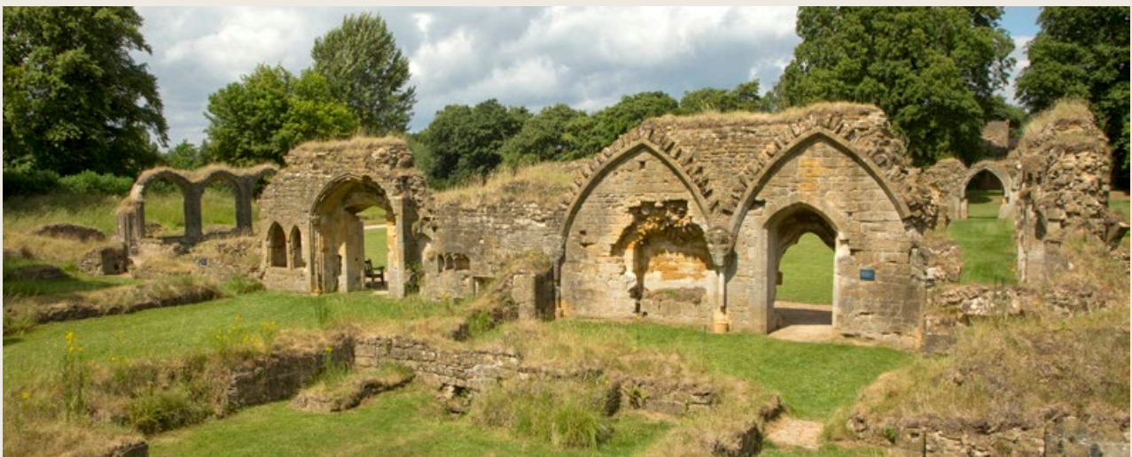
Hailes Abbey, Gloucestershire. © English Heritage

However, there were 84,462 education visits to English Heritage sites in the region in 2017/18, an increase of 9% on the previous year. English Heritage sites in the region have experienced 60% growth in numbers of education visits between 2001 and 2018.