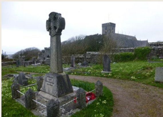
Pendeen War Memorial, Cornwall

One of 520 war memorials listed as part of a project to commemorate the First World War Centenary, Pendeen War Memorial in Cornwall was funded by public subscription, including a contribution from nearby Levant Mine. This is particularly poignant as on 20 October 1919, less than a year after the official end of the First World War, more local men were lost in the Levant Mine disaster. They are buried next to the war memorial.