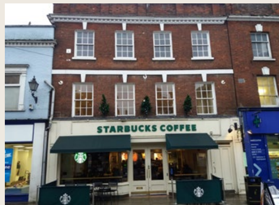
Grade II listed 39 Silver Street, Salisbury.

For more information visit www.heritagecounts.org.uk