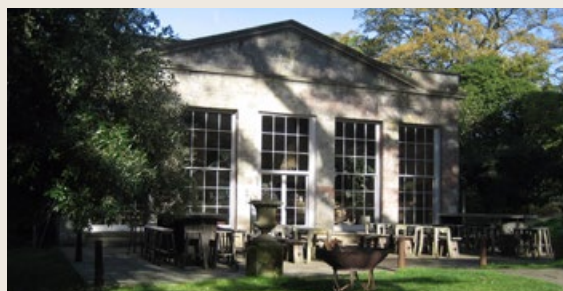
The Orangery at Combe House, Gittisham, East Devon, sensitively repaired and back in economic use.

The continued growth in the number of planning applications affecting historic parks and gardens shows that these historic assets are experiencing greater change than ever before. Schemes such as the transformation of Combe House and Grade II Registered gardens by a hotel chain shows that even in these complex historic assets, positive and sensitive change is possible.