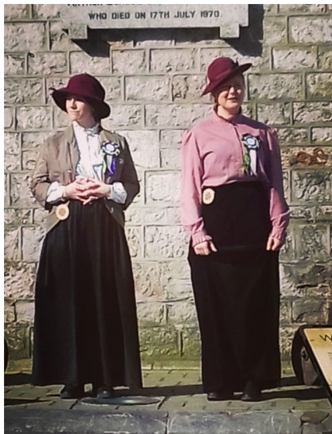
MED Theatre in role as Emmeline Pankhurst and supporter addressing the people of Newton Abbot, July 2018.