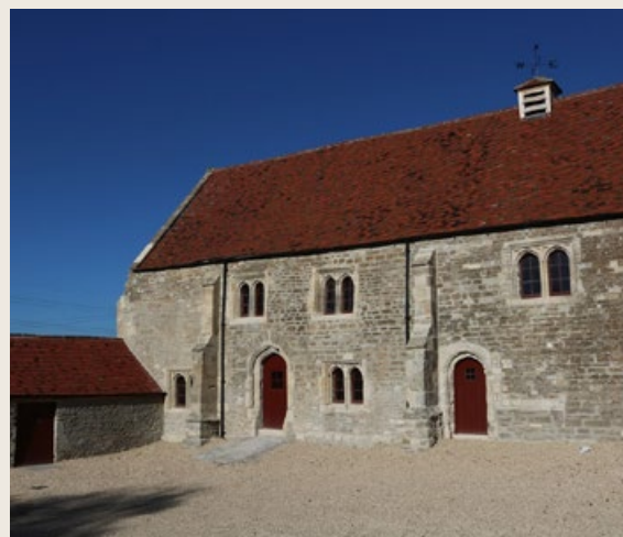
Brook Hall, Wiltshire

In the 20th year of the Heritage at Risk Register, more than two thirds of the entries on the original 1998 Register for the South West have been rescued, including the C15th lodging wing at Brook Hall, Wiltshire.