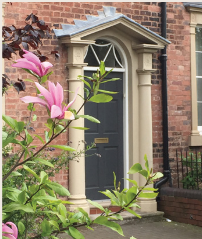
Image: Front door to one of the Georgian houses