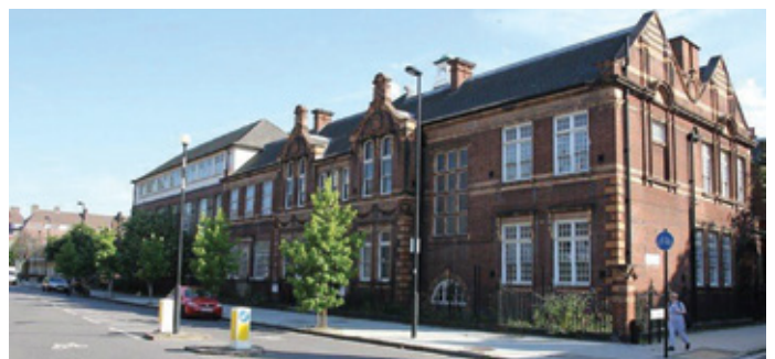
Image: The Beaufoy Institute, a Grade II listed building on the Heritage at Risk Register, now being restored by its new occupants, Diamond Way Buddhist UK and Diamond Way Teachings and Centres and once again open to the local community.

www.buddhism.org.uk/ www.buddhism-london.org/beaufoy-institute