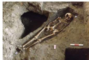
Image: Excavation of a burial site in the London Borough of Hounslow.

Historic burial grounds make a significant contribution to London's historic environment but can be affected by development – which can lead to lengthy and costly archaeological investigations.