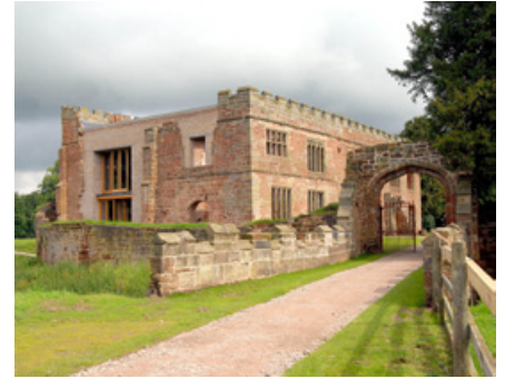
The formerly 'At Risk' Astley Castle, Nuneaton is now a Landmark Trust holiday let.

During the same period, listed building and conservation area consents rose and then fell to a low in 2009/10. Since then, however, they have remained relatively steady – but at a time when staffing levels have continued to fall. There is a risk that local authorities will be left without sufficient staff to deal with existing and future workloads. Planning applications have fallen by 30% since 2002/03 and, while this indicates less new construction is taking place, it is likely that many owners and developers are looking to make alterations to existing, listed property – thus the role of historic environment staff is more crucial than ever.